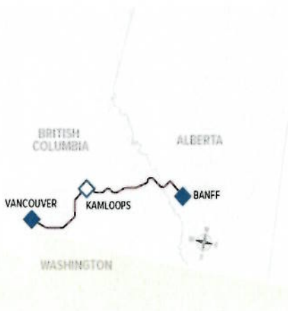
RAIL ROUTE MAP

After breakfast, board your private motorcoach for the Calgary International Airport for your flight back home. Breakfast at the hotel included.